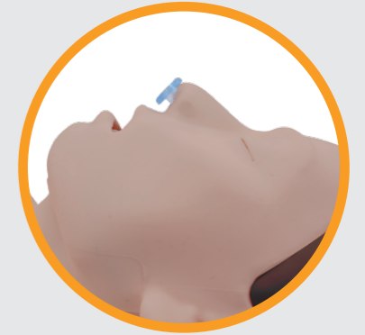
Nasal intubation (NPA, ETT)