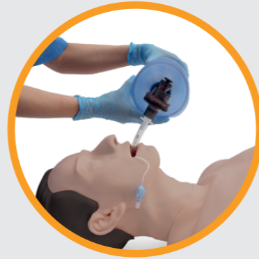
Ventilation with real-time feedback*