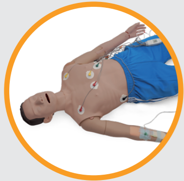
12-Lead ECG placement