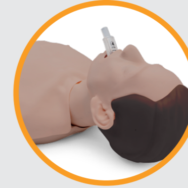
Oral intubation (OPA, iGel, LMA, LT, ETT)