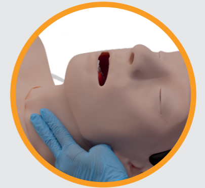
Automated pulse, synchronized with heart rate*