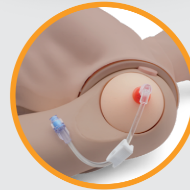
Humeral IO site