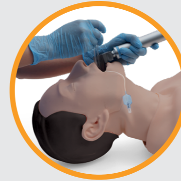
Practice intubation using basic to advanced airway management devices